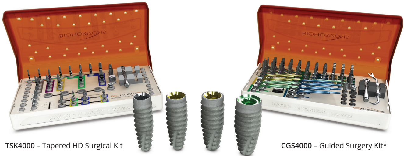
TSK4000 – Tapered HD Surgical Kit

BioHorizons Tapered Pro implants can be placed with the existing freehand and guided surgery kits. The surgical kits include the instrumentation required for Tapered Pro, Tapered Plus, Tapered Internal and Tapered Tissue Level implants.